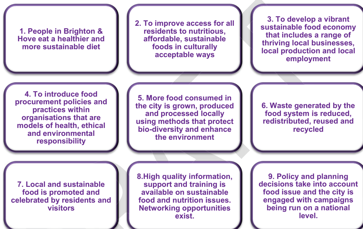
Fig ?? Nine Aims of the Food Strategy

Locally many of the challenges we face as a city – poverty, health inequalities, economic development, climate change and waste – have a food dimension. Establishing a sustainable local food system in a global economy may seem a daunting task, because of the huge changes that will need to take place on a national and global level but there is action that we can take as a city. For all nine aims we will act locally on those components that we can influence whilst lobbying at a national and international level for other improvements.